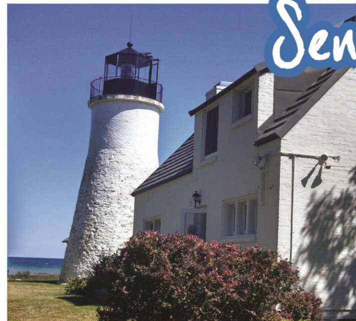
Old Presque Isle Lighthouse "The Haunted Light," courtesy Angela Soltysiak.